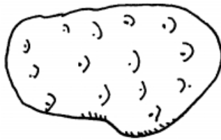
Before subjecting to the conditions