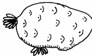
After subjecting to the conditions

(i) Which process of potato treatment is illustrated above. (1mk)