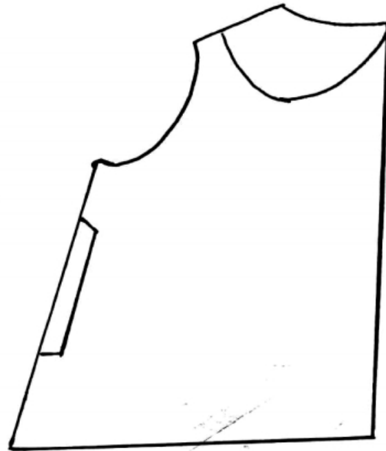
THE LAYOUT (NOT DRAWN TO SCALE)